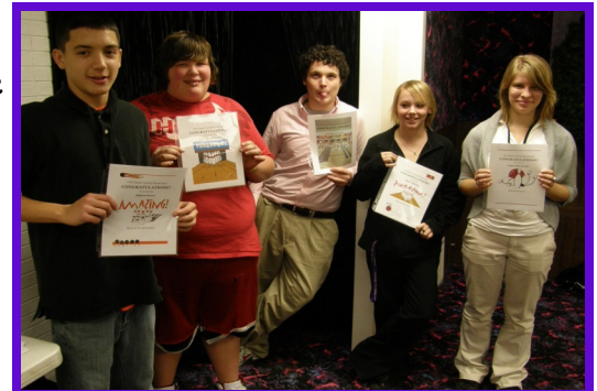
Prize Winning Bowlers!!