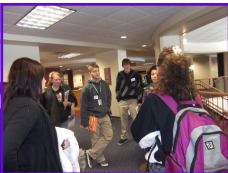
Scholars on a Campus Tour